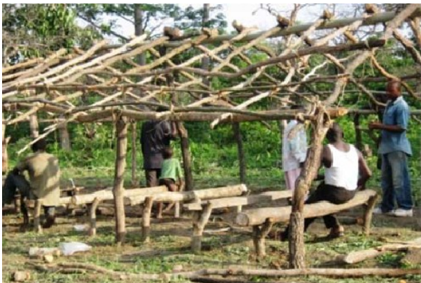
a church under construction