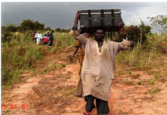
Carrying books on their heads