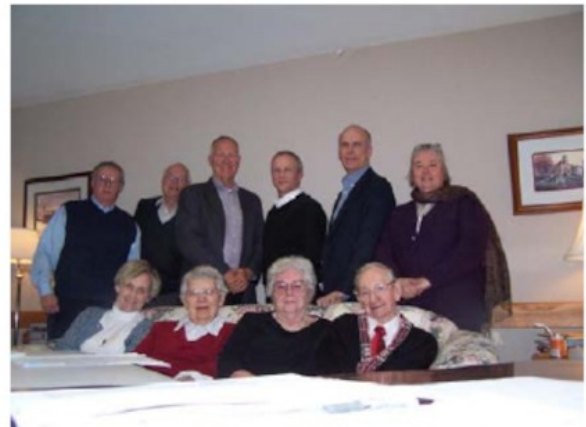
Members of Manna Publications Board