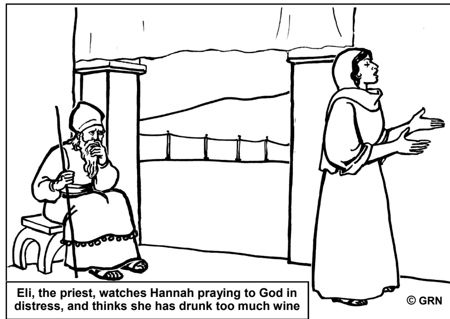
Eli, the priest, watches Hannah praying to God in distress, and thinks she has drunk too much wine

Hannah replied, "May you be pleased with me" (1:18). His prayers and his blessing encouraged her. She gave thanks and blessings to God and to Eli.