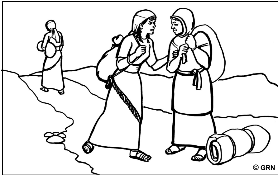
Ruth chooses to follow her mother-in-law Naomi and trust in the One True God of Israel while Orpah returns to her mother and the false gods of Moab